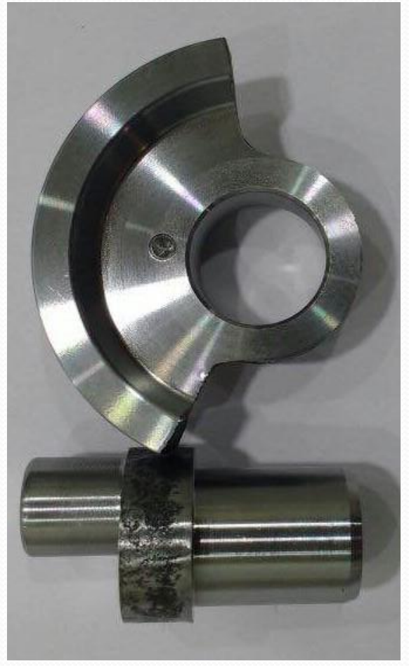
Chennai Forge Products Pvt Ltd.